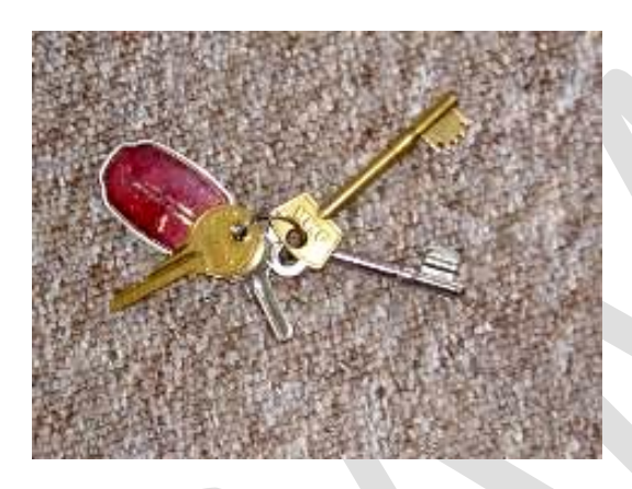
Keys issued to tenant at check in

TENANT INITIALS: A. Tenant Page 30 of 30 Date: 1^{st} January 2010 ©WSM Inventories LLP 2010