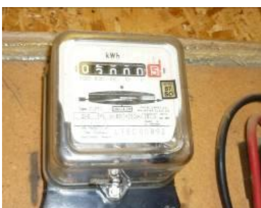
Gas and electric meters